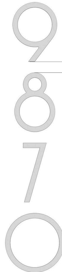
B. Vertical Installation